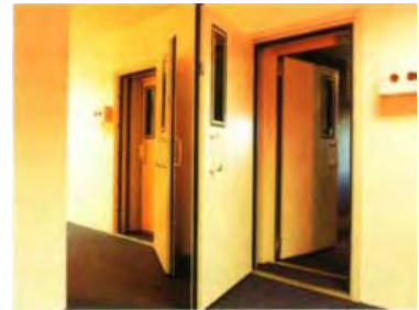
Noise-Lock® acoustic doors, windows and wall linings