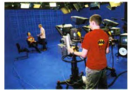
Modular studios, control/editing rooms and voice-booths

Units are provided with four sheet metal lugs situated off centre for fixing onto walls or ceilings via a Unistrut fixing channel or timber framing. A gap of 25mm exists between the back of each unit and the fixing surfaces.